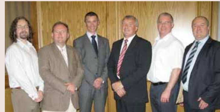
Speakers at the Respiratory Workshop:

As a result of initial discussions at the workshop, a confidentiality agreement was prepared between Axellis Medical Technologies and Northern HSC Trust to enable more detailed discussions of a collaborative project. It is hoped that other collaborative R&D programmes will emerge from new relationships formed at this event.