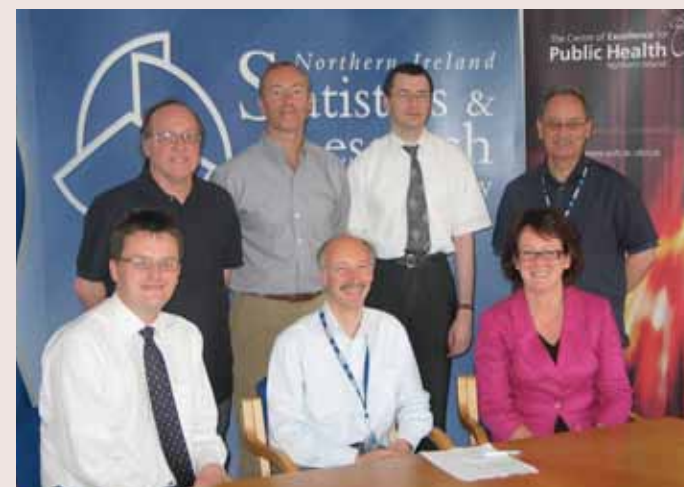
At the launch of NILS RSU, from left:

For more details about both the data resources and the service offered by the NILS-RSU either contact the support unit ( nils-rsu@qub.ac.uk ) or visit the web-site ( www.qub.ac.uk/nils ).