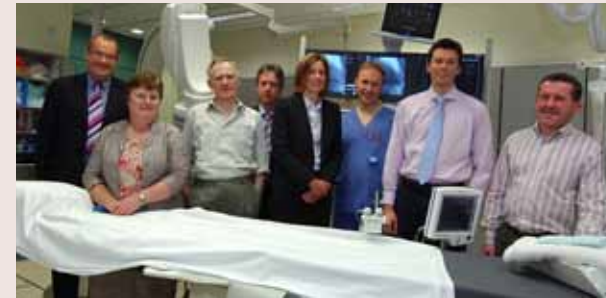
The RADAR-ACS team from SHSCT and Randox Ltd