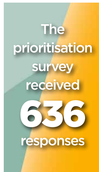
Table 5: Survey respondent types and completion rates

Eighty eight (14%) of responses were from the patient group (Table 5).